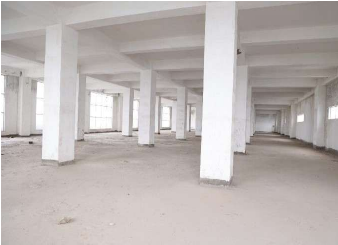
Site Photograph of offered commercial space with tentative area