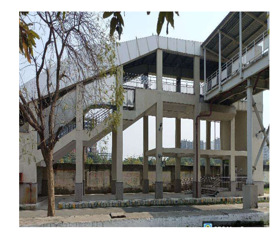
(Gate No. 1)