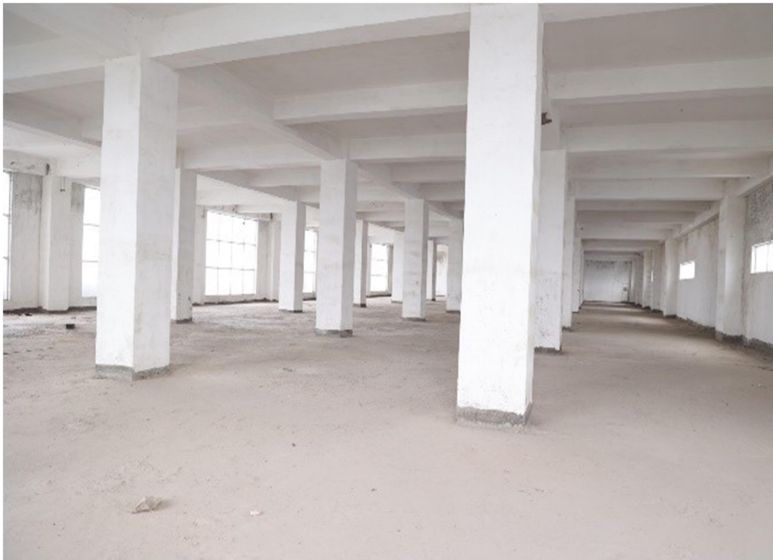
Site Photograph of offered commercial space with tentative area