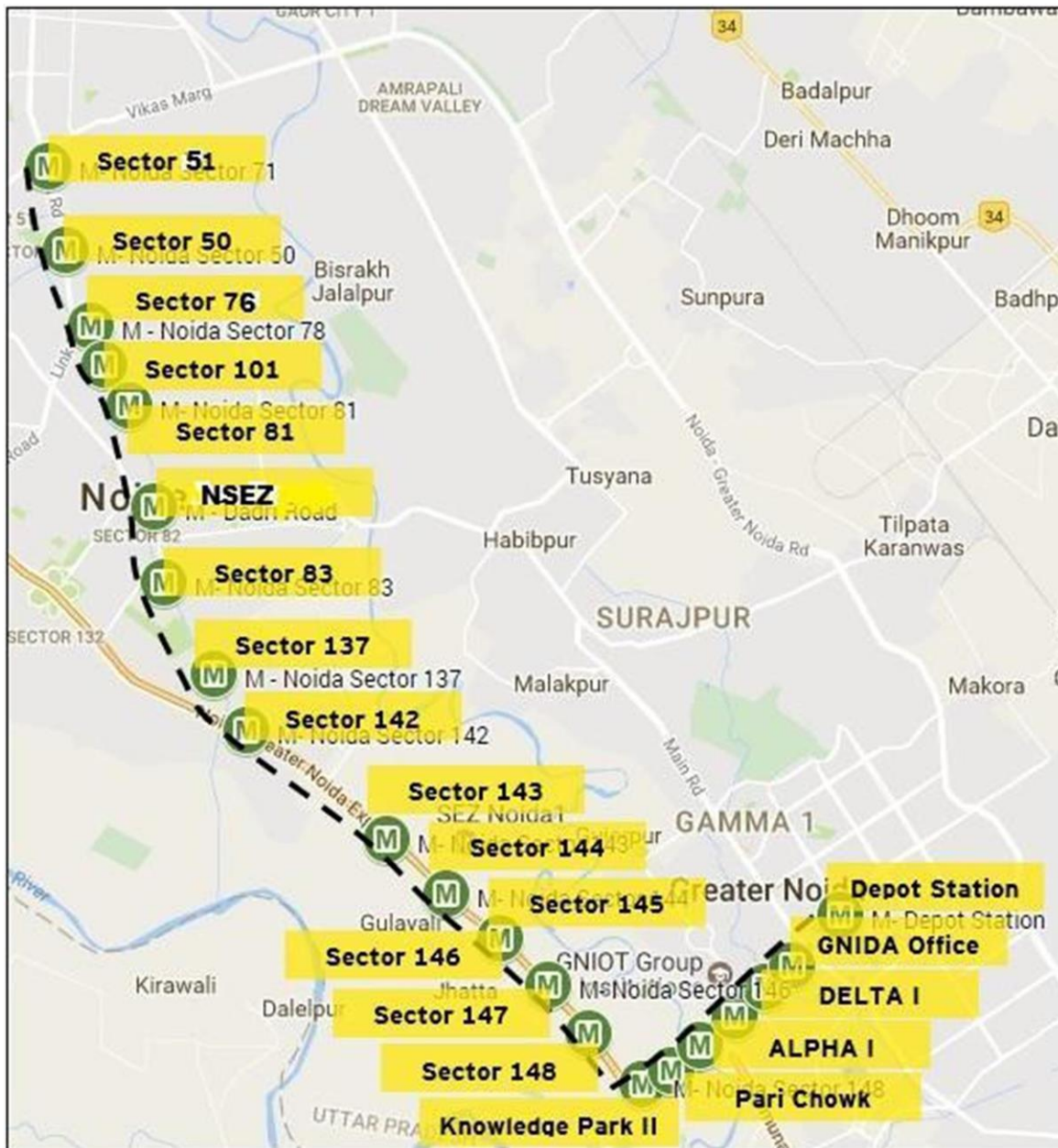
Fig: The Existing Metro Line

Please Note: The map shown above is indicative (not to scale)