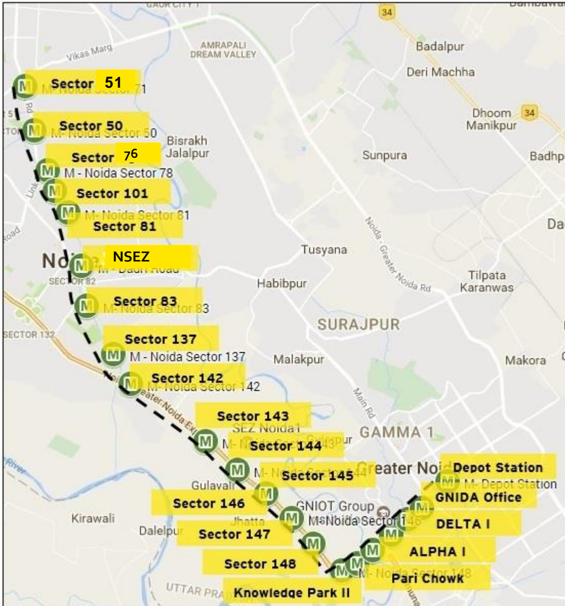
Fig: The Upcoming Metro Line

Please Note: The map shown above is indicative (not to scale)