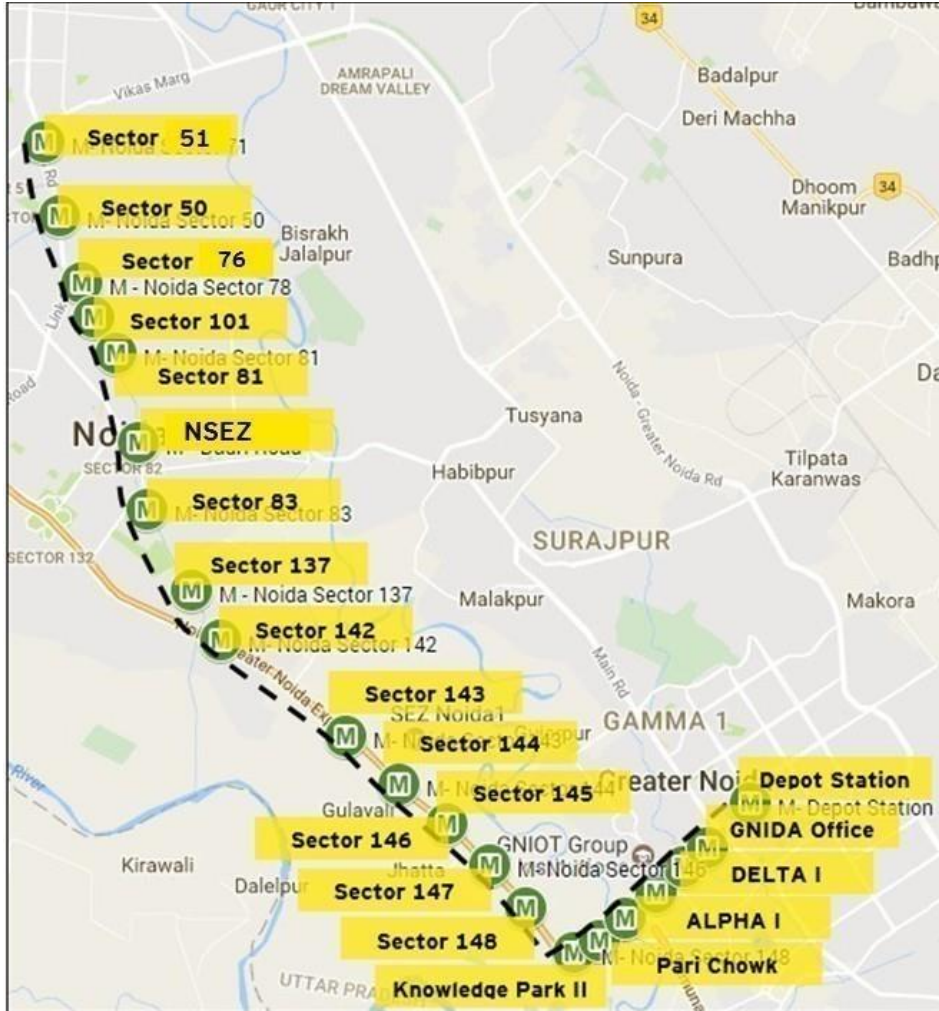
Fig: The Metro Line

Please Note: The map shown above is indicative (not to scale)