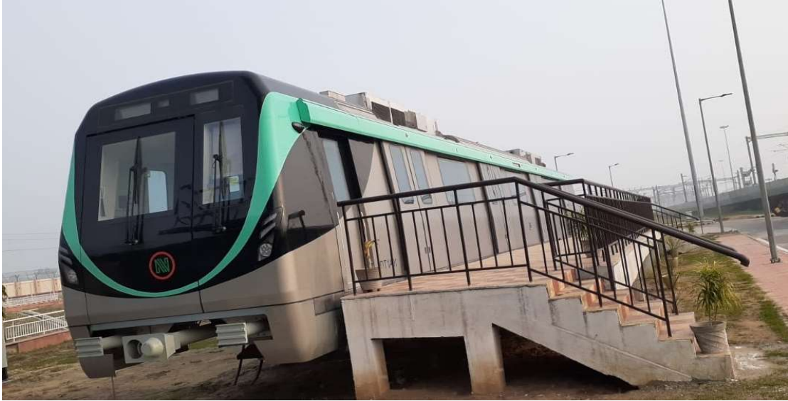
Photograph of Mock-Up Train Coach presently placed at Metro Depot, Greater Noida